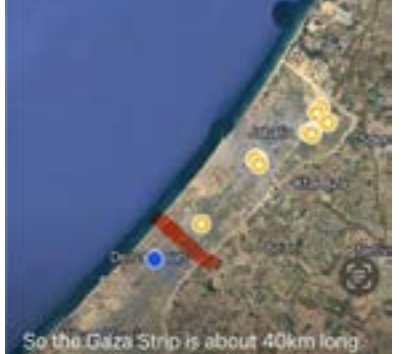
he Gaza City area. That

The situation looked very much like you see on the news - dire. Gaza is a patch of land on the edge of the Mediterranean Sea, 40km long and 10km wide at its