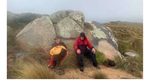
The Rest, after the Climb

The westerly blew out after a day or two, so we set a bee-line course to Port Phillip. A full-sized container ship appeared to cross our bow from port, but we reckoned that we should pass astern of it okay. Its progress was slower than expected, but we left Pelican on auto pilot. It would be a